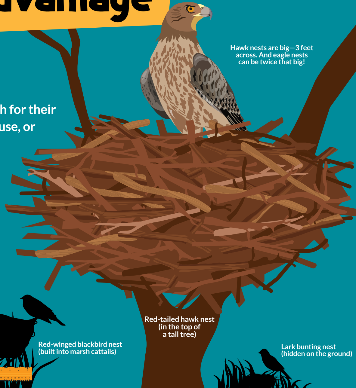
Red-tailed hawk nest (in the top of a tall tree)