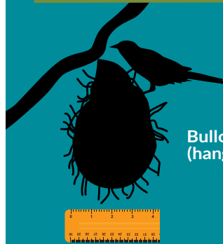
Bullock's oriole nest (hanging from a branch)

These birds all nest at Bluff Lake. Look for them as you explore today.